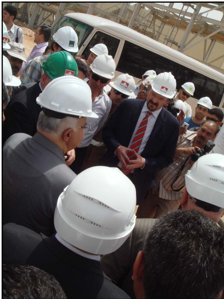
Prime Ministerial visit to Ebla Project Site